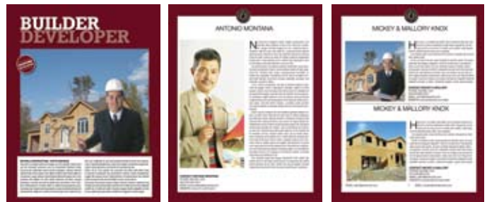
Lead Page 150-200 words