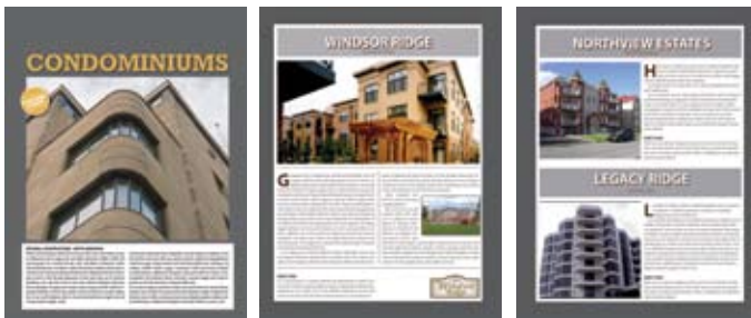
Lead Page 150-200 words