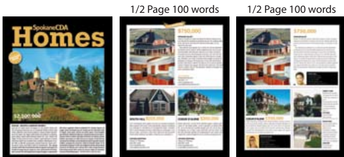
Lead Page 150-200 words