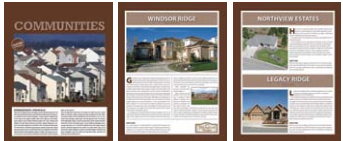
Lead Page 150-200 words