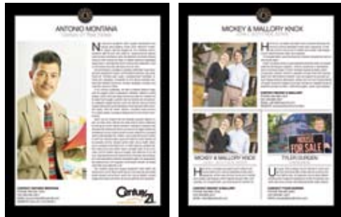
Full Page 450 words